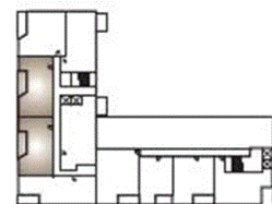
2 nd floor