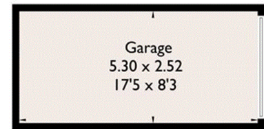
(Not Shown In Actual Location / Orientation)