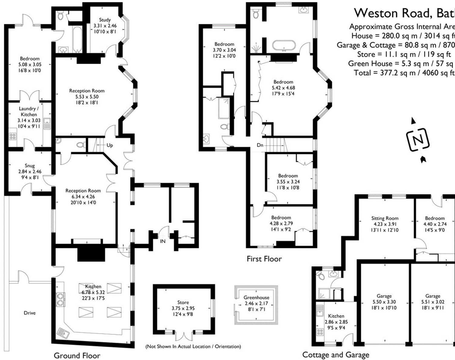
Illustration for identification purposes only. Not to scale Ref: 211437

Approximate Gross Internal Area House = 280.0 sq m / 3014 sq ft Garage & Cottage = 80.8 sq m / 870 sq ft Store = 11.1 sq m / 119 sq ft Green House = 5.3 sq m / 57 sq ft Total = 377.2 sq m / 4060 sq ft